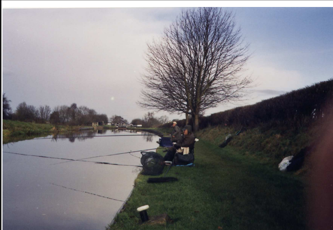
Winter fishing in short length adjacent to Bridge 75

Bridge 69 - Greenbank - SJ670391 TF9 3SU